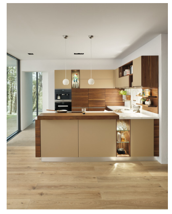
versatile design style

This press release, in addition to other press materials and photos, is available for download at www.team7.at .