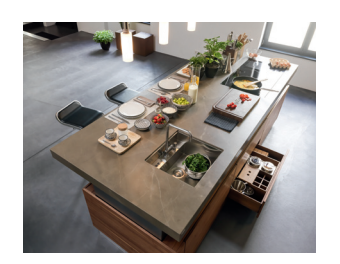
all-in-one – work surface and breakfast bar

This press release, in addition to other press materials and photos, is available for download at www.team7.at .