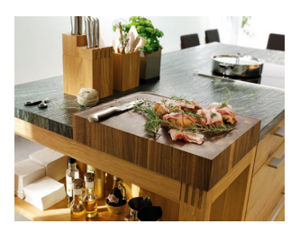
integrated butcher's block with juice rim

The loft kitchen combines the natural qualities of wood – including its many positive characteristics – with the elegance of craftsmanship detailing and finish, as well as optimal functionality.