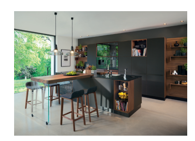
black line kitchen

black line is a strikingly elegant version of the linee kitchen, created by TEAM 7's head designer, Sebastian Desch. Matt black coloured glass is combined with fine smoked glass, matt black handles and plinth panels. Open and closed design elements made from pure solid wood give the kitchen a more relaxed style and create a cosy look. Of course, black line remains a solid wood kitchen at heart: behind the cool elegance of its black surfaces are solid wood elements, giving the kitchen warmth and stability. This purist designer version of a solid wood kitchen combines wood, glass and metal to create a thoroughly modern kind of cosiness.