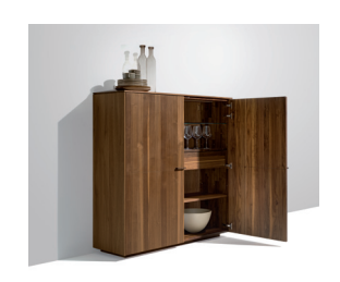
filigno sideboard and highboard link cooking, dining and living areas

This press release, in addition to other press materials and photos, is available for download at www.team7.at .