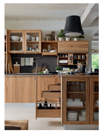
country cottage warmth

In the rondo country-style kitchen, the interiors of cupboards and drawers can be designed to your own requirements and ideas – with options such as the ingenious plate shelf that protects porcelain dishes. The flexible spacers can be adjusted to the size of your plates and dishes using the matrix of holes in the solid wood base. Natural wood also has the great advantage that it is particularly protective of good porcelain.