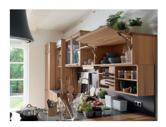
practical and compact

This press release, in addition to other press materials and photos, is available for download at www.team7.at .