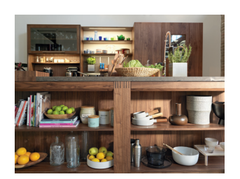
authentic materials and premium artisan craftsmanship

This press release, in addition to other press materials and photos, is available for download at www.team7.at .